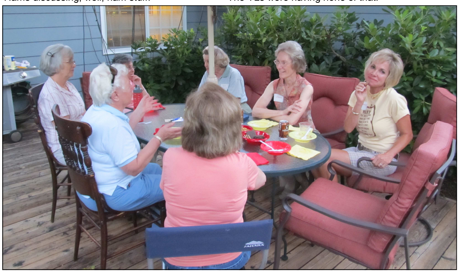
RVARC September 2012