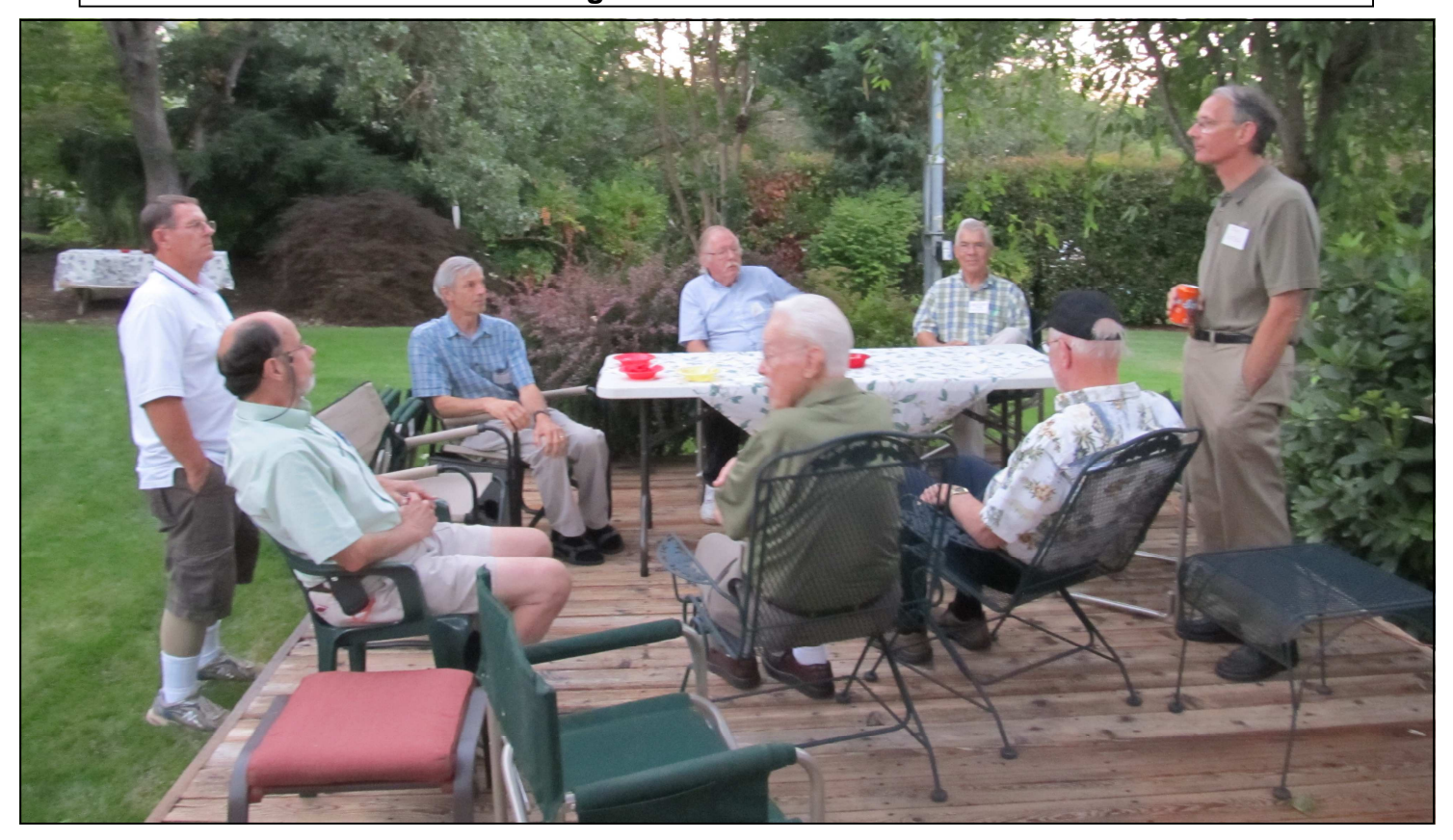
Hams discussing, well, ham stuff.